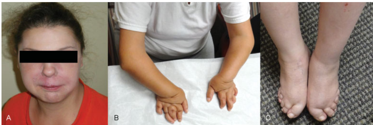
Fig. 3 (A) Anteroposterior view of the patient's mother at age 33 showing hypertelorism, triangular facies, bulbous nose, hypoplastic nares, prominent columella, micrognathia, and chin dimple; (B) View of both hands of the same patient showing deformities and ulnar deviation of both wrists, elbow deformities, skin dimple at metacarpophalangeal joints, and deformities of fingers; (C) View of both feet of the same patient showing bilateral deformities in both feet and toes.