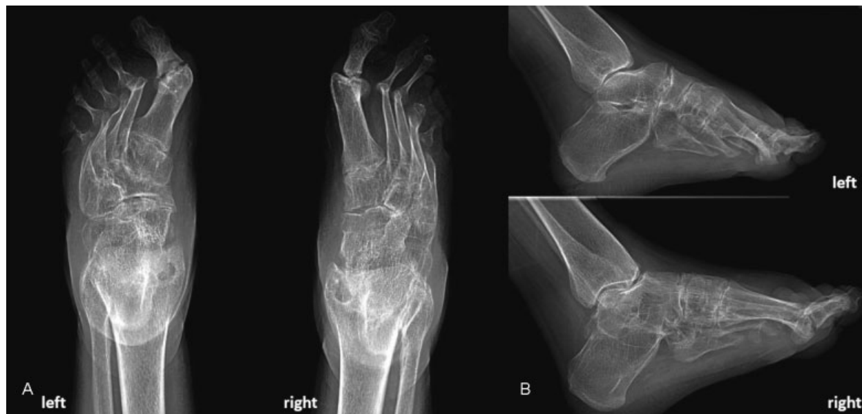
Fig. 5 Anteroposterior (A) and lateral (B) view of both feet revealed marked osteolysis, dysplastic changes, and narrowed joint space of tarsal bones.

confirmed through the identification of an MAFB gene mutation in the proband. The proband's mother showed classic clinical characteristics of MCTO, such as joint pain in the wrists and feet with radiographs revealing carpal and tarsal osteolysis. In addition to the classic clinical characteristics of MCTO, the proband also developed involvement of the MCP, PIP, and distal interphalangeal joints with imaging proven synovitis of the wrist, the above-mentioned joints and Boutonnière deformities of the fourth and fifth fingers on the left hand and the fifth finger on the right hand. Both mother and son have a history of learning disabilities.