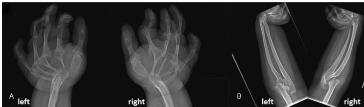
Fig. 4 (A) Hand and forearm radiographs of the mother at age 33 revealed ulnar deviation of the wrists, absent carpal, and proximal metacarpal bones; proximal metacarpal bones are eroded and tapered; interphalangeal joints are distorted; (B) Elbow radiographs of the same patient revealed deformities.